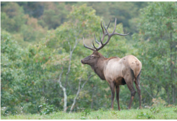
Nice bull on the Elk County Visitor Center property.

The newly constructed Elk County Visitor Center opened in September. The