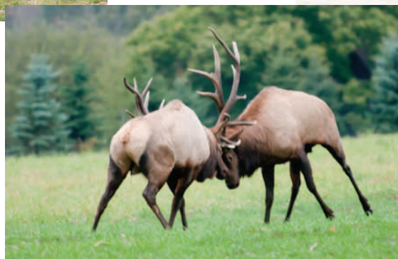
Two bulls lock horns during the 2010 Fall Rut. It was quite an experience to witness this firsthand!