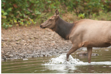
A cow slowly makes her way across the creek.

Purchasing photographs from my website is quick and easy. All of my sports galleries have a PayPal/ Credit Card option, so you can purchase a variety of print sizes and other photo products of any photograph in these galleries. Print sizes include 4x6, 5x7, 8x10, 8x12, 11x14, 12x18, &