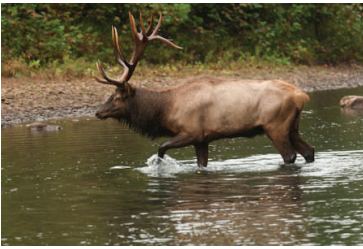
Bull elk crossing the Sinnemahoning Creek.

Dick McCreight and I hosted another Pennsylvania Elk Photography Experience this fall. The photo trip featured quite a bit of rain, but this didn't deter the participants on this trip! We had a great time photographing the elk, sometimes even opting to shoot in the rain. We saw a lot of elk each day and even were able to photograph a small herd of elk crossing the creek!