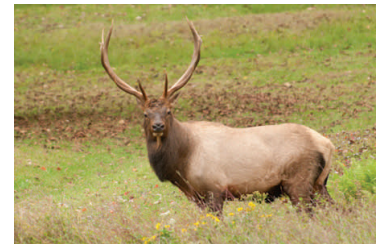
Large bull looking right into the lens.

photography as well. The blog is a fun way for me to share my photography adventures!