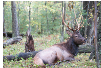
Small bull resting after eating lots of acorns.

over in bed to stay warm and dry. The next time it rains, tough it out and see what photographs you can capture!